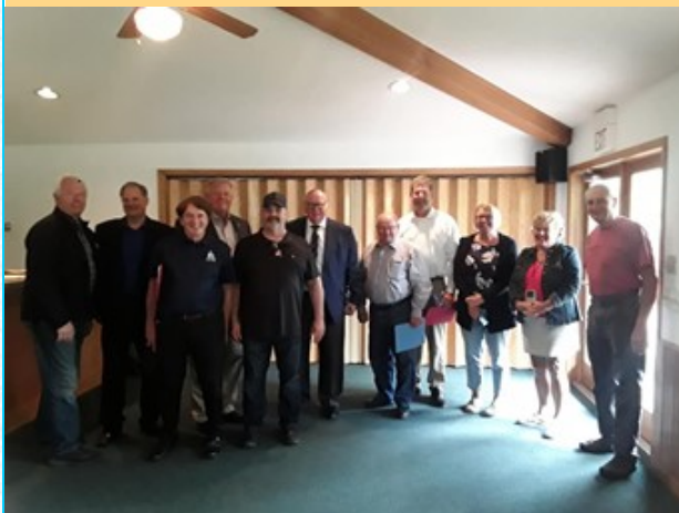
Senate Bonding Committee visiting Lake Shamineau